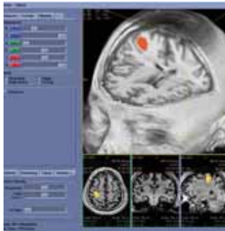
Figure 2. The BrainWave interface provides the capability to view fMRI results on 3D renderings or orthogonal slices. A simple motor task is presented in orange and yellow colors in the above screen.

Drs. Drevets and Bodurka anticipate their research and clinical efforts can change the way certain psychiatric diseases are diagnosed and managed. ■