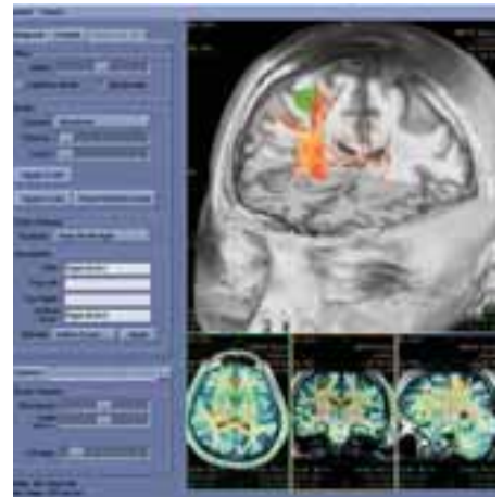
Figure 3. BrainWave also provides the flexibility to overlay Fractional Anisotropy maps on the orthogonal slides, create composite maps with multiple fMRI studies and the ability to combine those results with fibers tracked from DTI acquisitions.