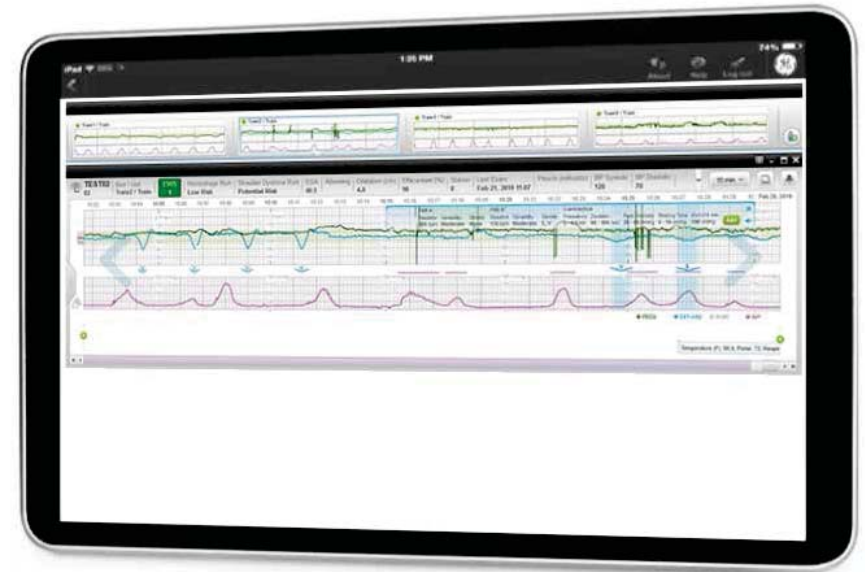
Centricity Perinatal Fetal Strip Analytics