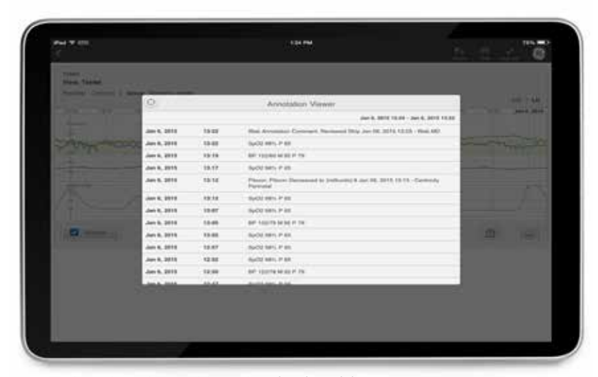
Annotations Viewer in Centricity Perinatal Web Module