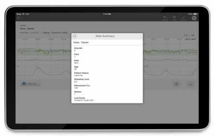
Web Summary showing the latest charted data