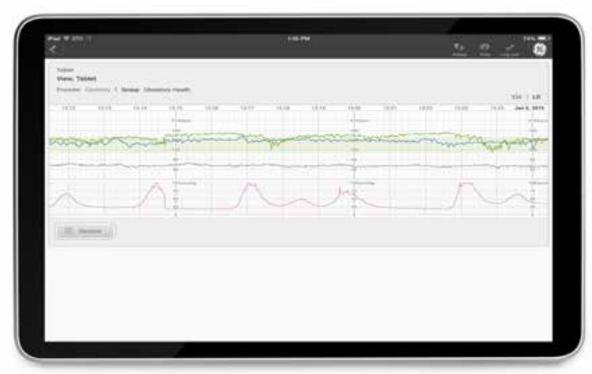
Centricity Perinatal Web Module Streaming View - Physician and Group Display