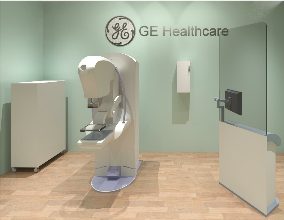
9-32 - Seno Essential

Hold the Left Click for Rotating around Use the Scroll for Zooming in and out