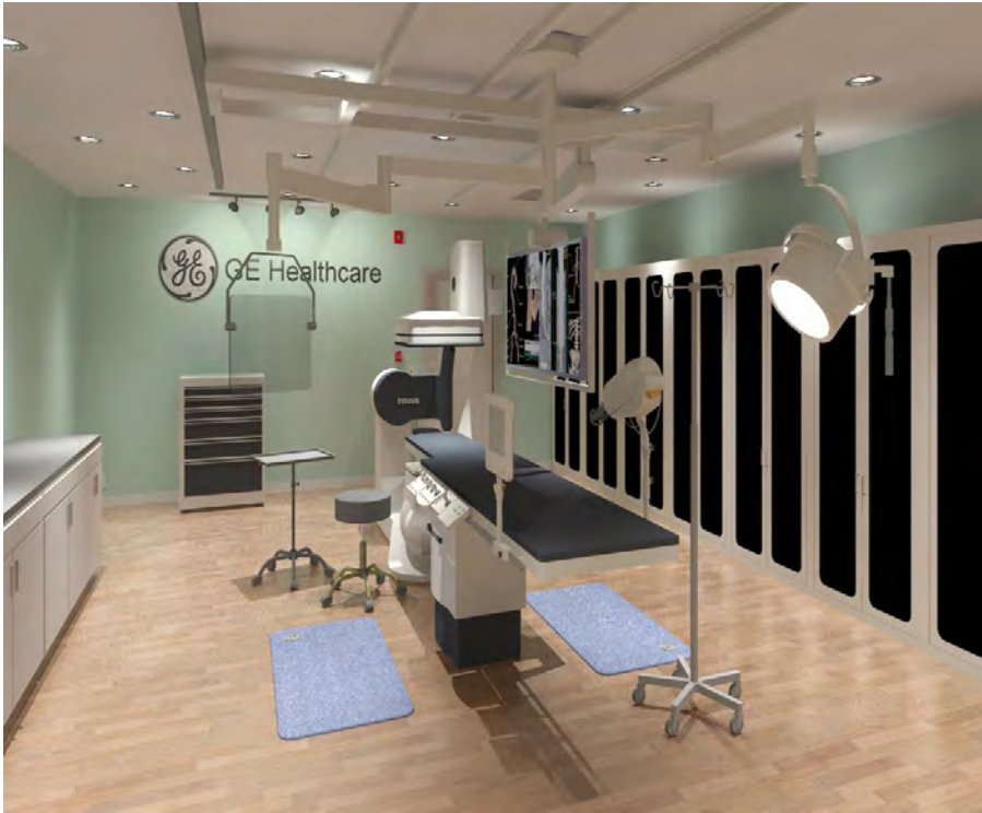
Single Plan Innova IGS 540

Hold the Left Click for Rotating around Use the Scroll for Zooming in and out