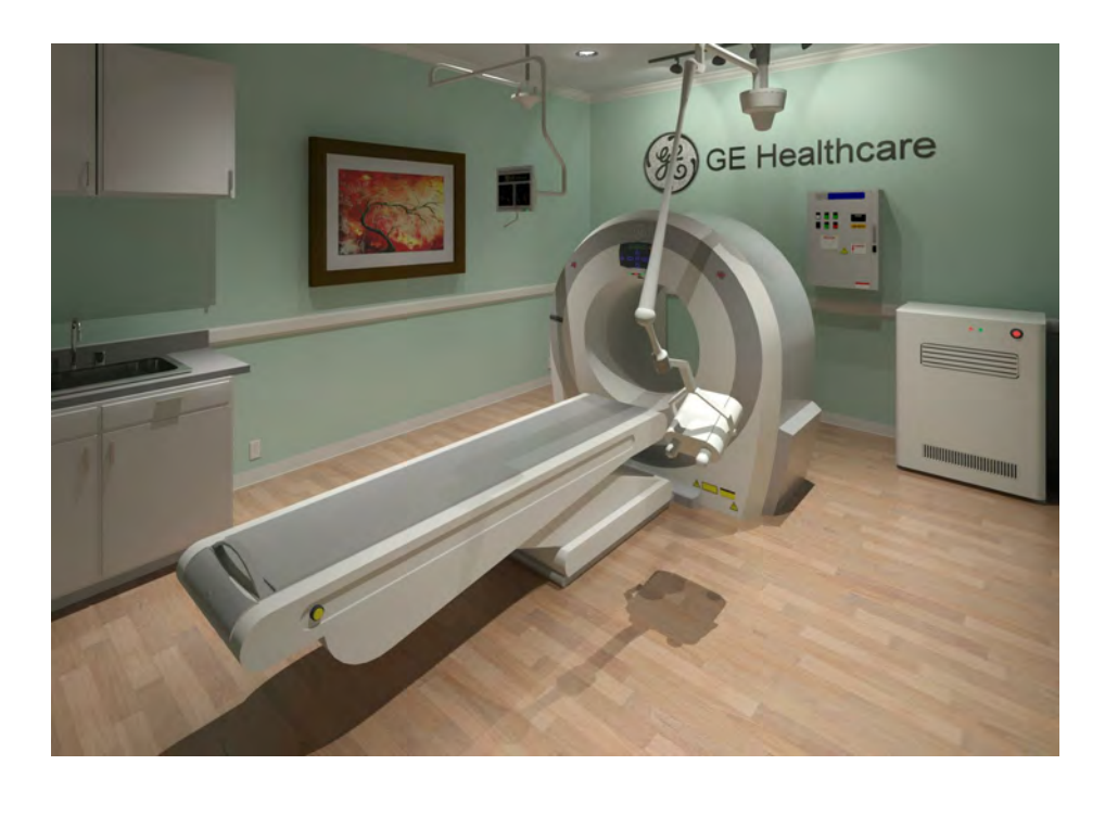
6-110-Revolution ACTACTs 16 Slice

Hold the Left Click for Rotating around Use the Scroll for Zooming in and out