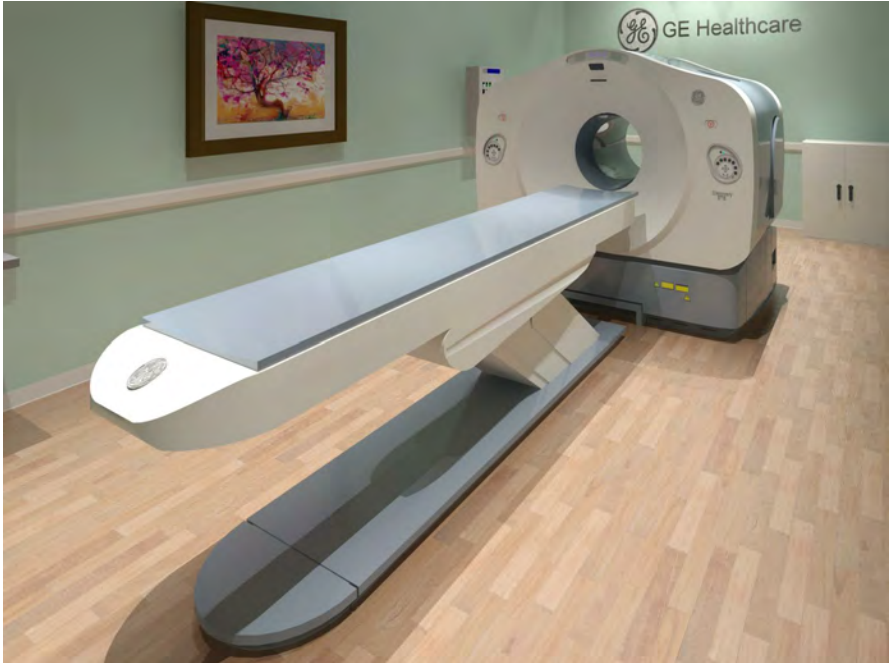
12-14 Discovery STE

Hold the Left Click for Rotating around Use the Scroll for Zooming in and out