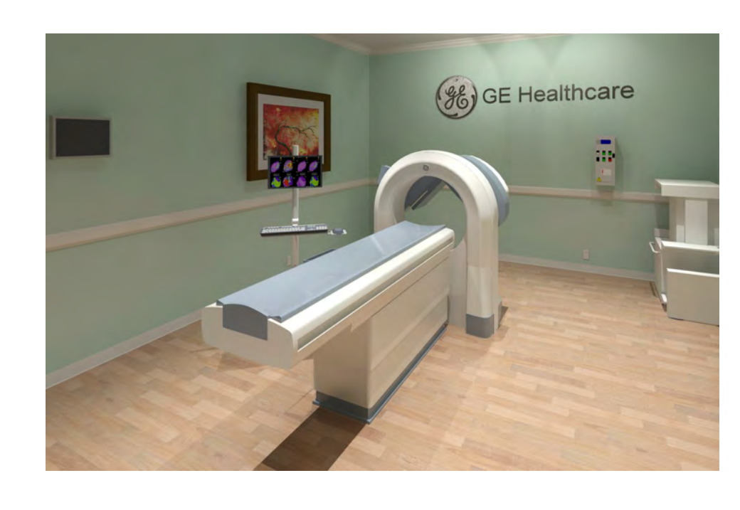
7-66 - Ventri w Premium Table

Hold the Left Click for Rotating around Use the Scroll for Zooming in and out