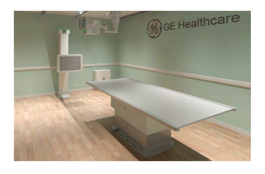
1-150 - Discovery XR646

Hold the Left Click for Rotating around Use the Scroll for Zooming in and out