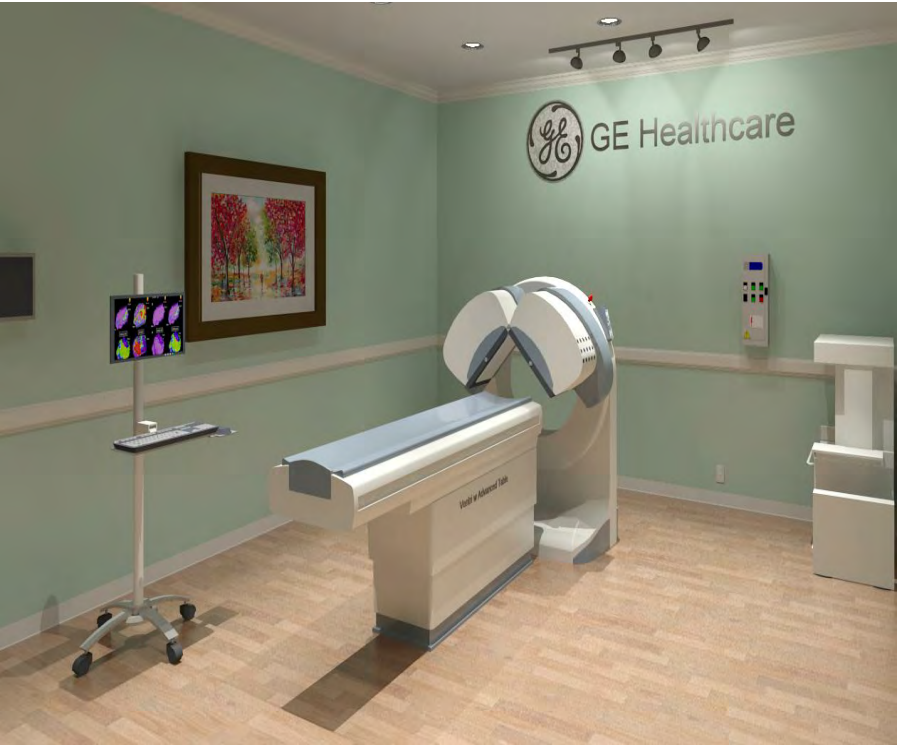
7-86 - Ventri w Advanced Table

Hold the Left Click for Rotating around Use the Scroll for Zooming in and out