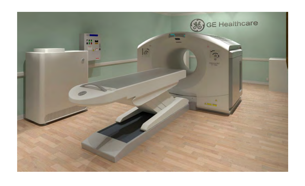
12-24 - Optima PET-CT 560

Hold the Left Click for Rotating around Use the Scroll for Zooming in and out