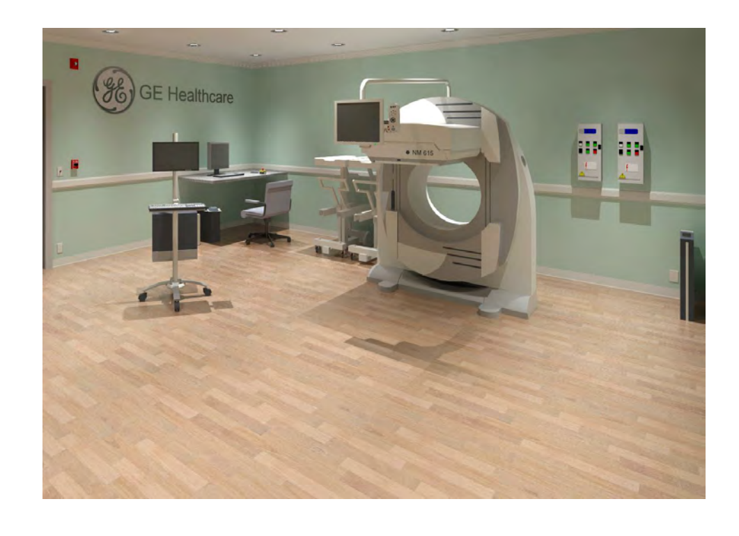
7-90 Brivo NM 615

Hold the Left Click for Rotating around Use the Scroll for Zooming in and out